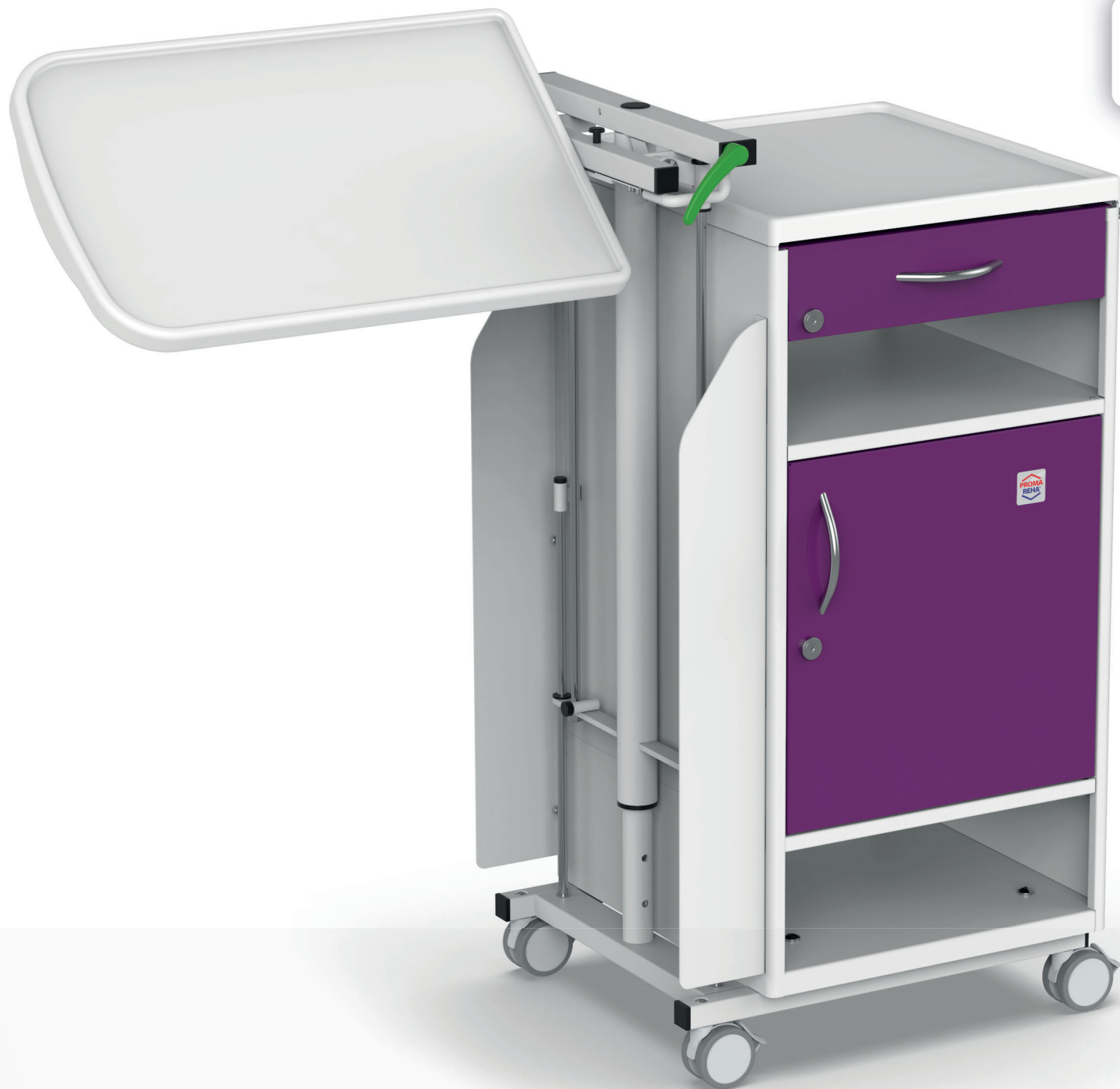
NS-21 Bedside tables