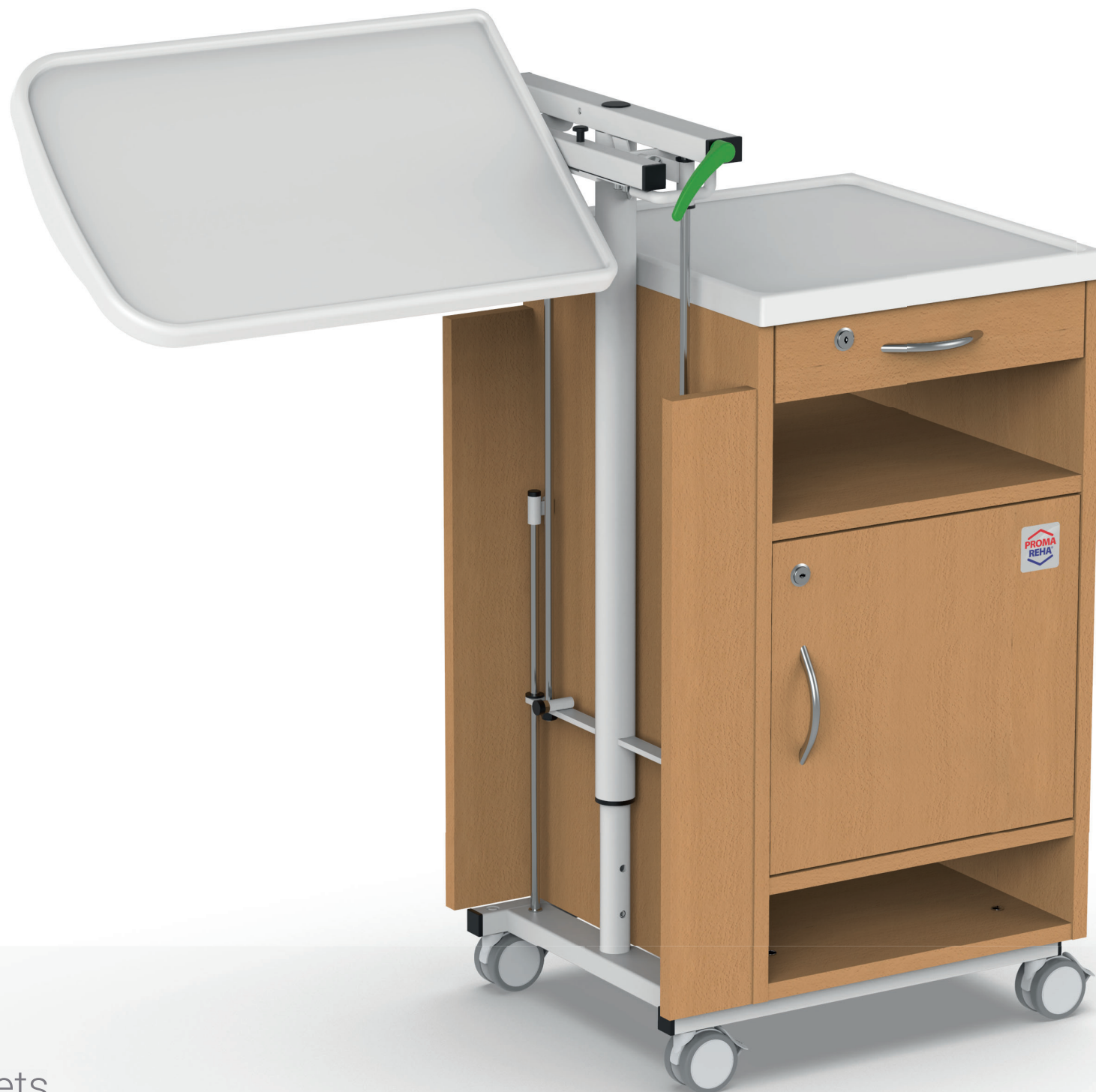
NS-1 Bedside cabinets